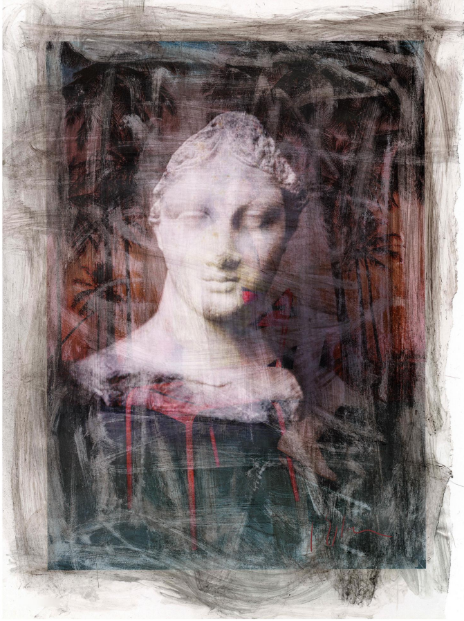
Stranger than before 1768x2500 Piksel 2022 Mixed media, Fineart print