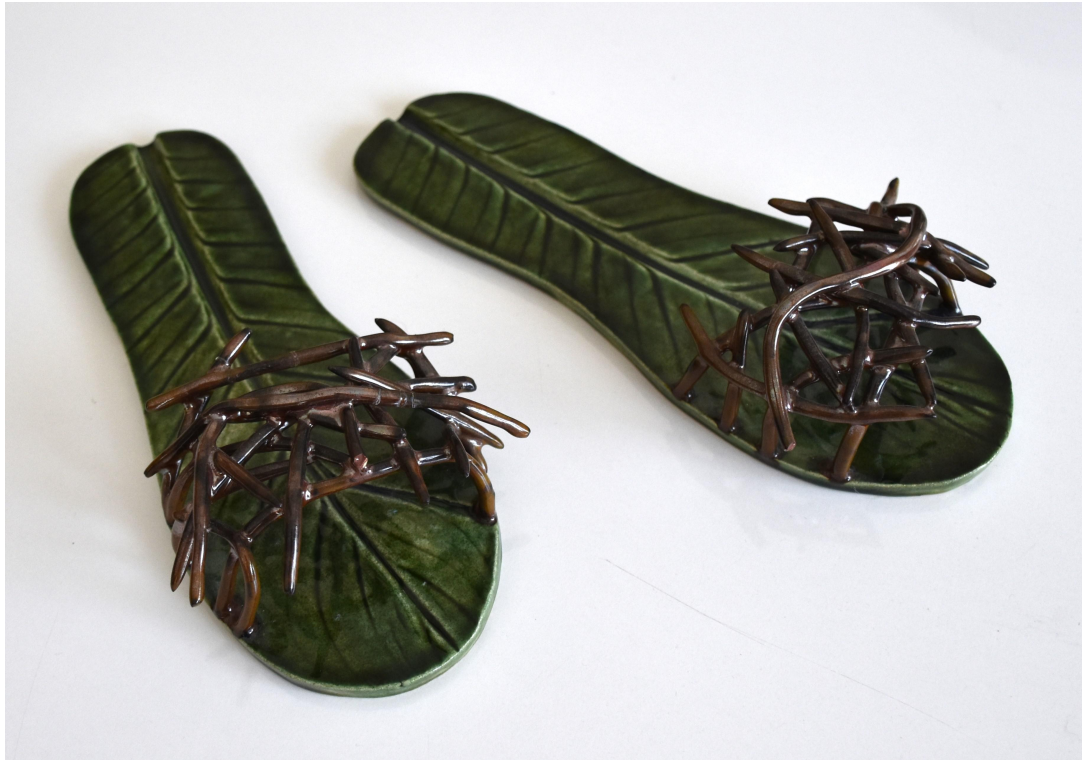
Nature 20 X 7 cm 2021 Ceramic Hand Forming, 1060° Glazed Firing