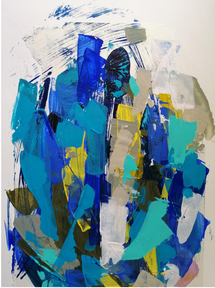
Untitled 30x40 cm. 2022 Kağıt üzerine akrilik / Acrylic on paper