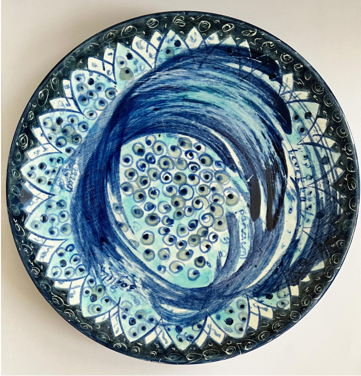
Mekansız Çap 20 cm 2022 Underglaze tile 950 DERECEDE fired