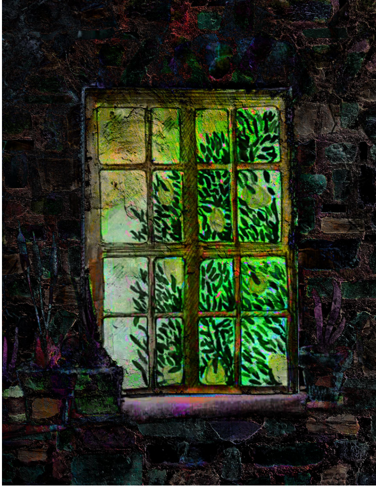
Pandemi 2200x 1700 pixel 2022 Mixed Technique