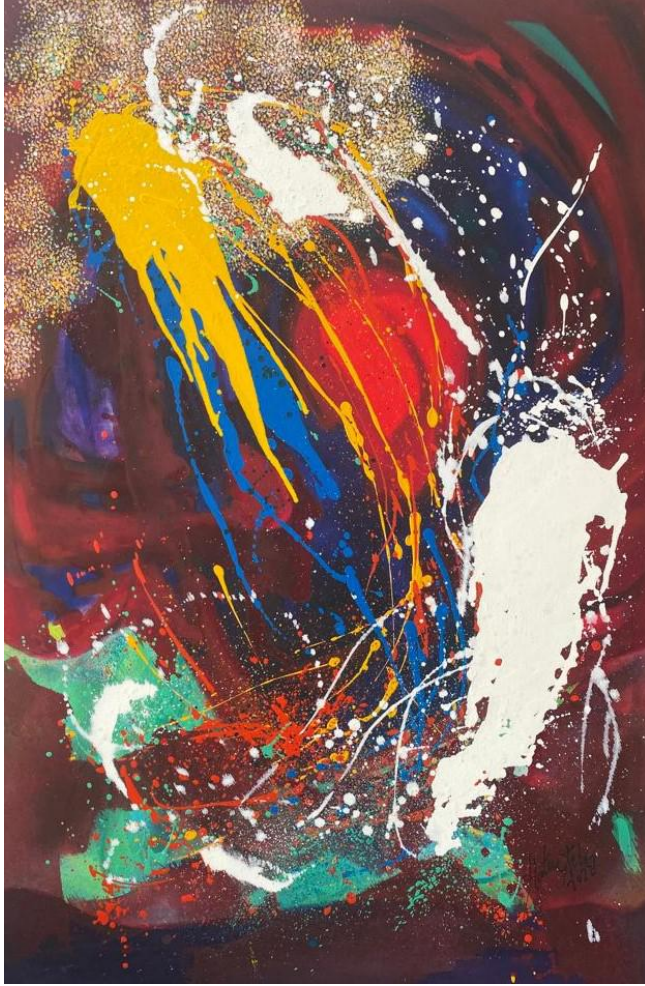
Energy 110x80 cm 2022 Kariřık Teknik / Mixed